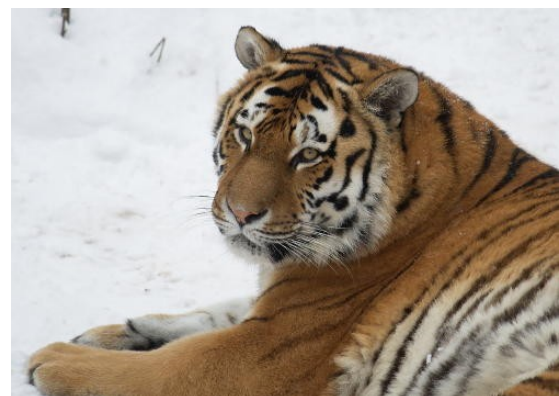
Only 400 Siberian tigers are left in the wild; so although not extinct, like many creatures, they no longer play any meaningful role in the ecology of their natural range.

Feel free to upload, print and distribute this sheet as you see fit. 220+ topics on our website, each with introduction, books, courses, products, services, magazines, links, advice, articles, videos and tutorials.