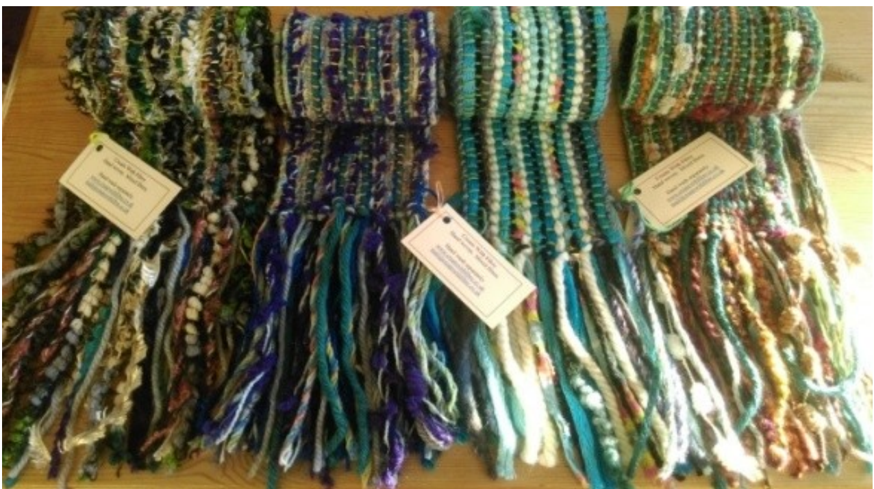
Scarves woven by Create With Fibre for sale in museums and galleries.

At Create With Fibre, scarves like these are woven for sale in museums and galleries.