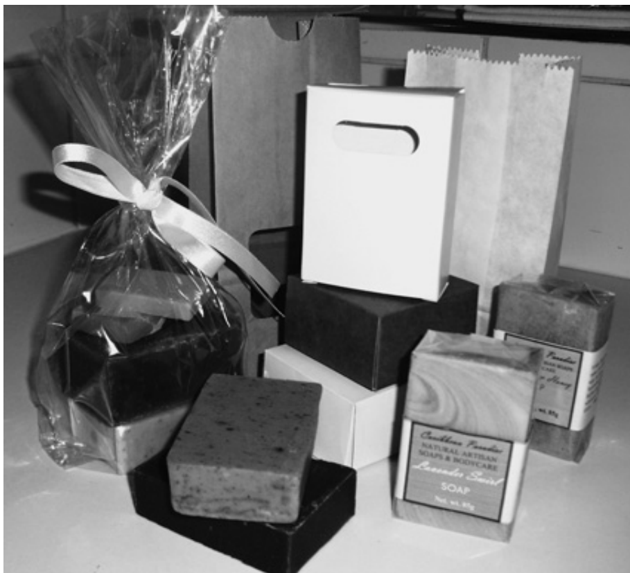
fig 56: just a few of the ways you can package your soaps

Having lovingly laboured over your soap creations it is time to display them to their maximum effect. In other words, it is show-off time! There are lots of things you can do to finish and decorate your soaps. Here are a few ideas to get you started.